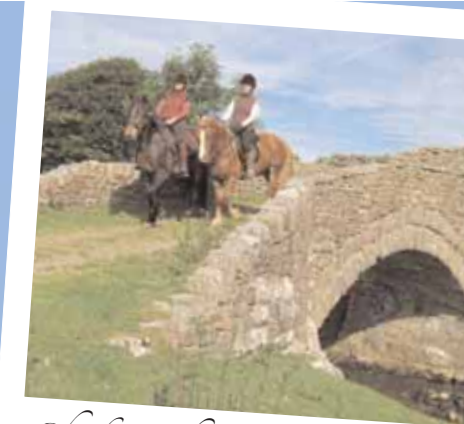
Check out the terrain you may meet